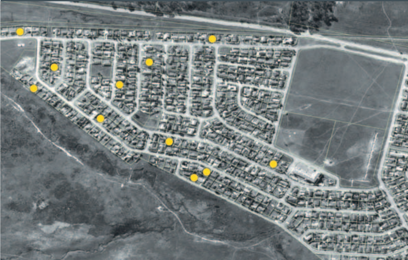
Aerial photograph of households selected for the master sample