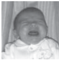
Children's facial expressions of emotional states